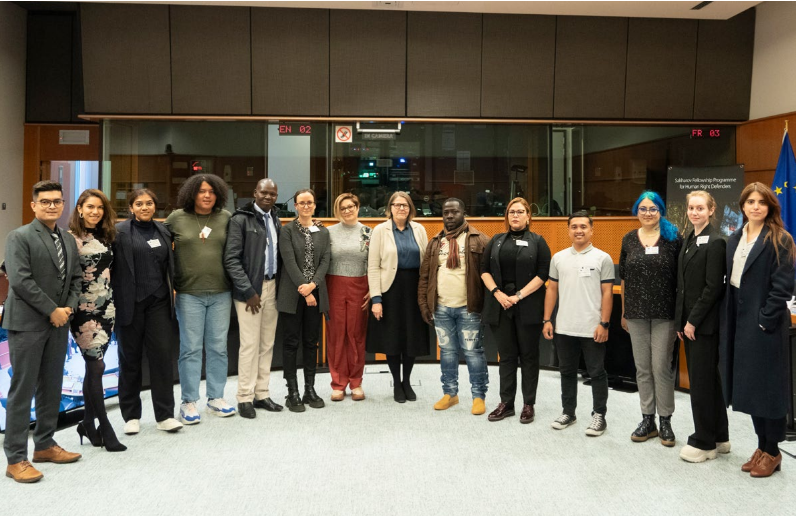
▶ SAKHAROV FELLOWSHIP 2024 WITH VICE-PRESIDENT HEIDI HAUTALA

Through its Triangle for Democracy Programme , Members accompany partner Parliaments in bringing together legislators, civil society, and media actors to tackle dis-information while protecting freedom of expression.