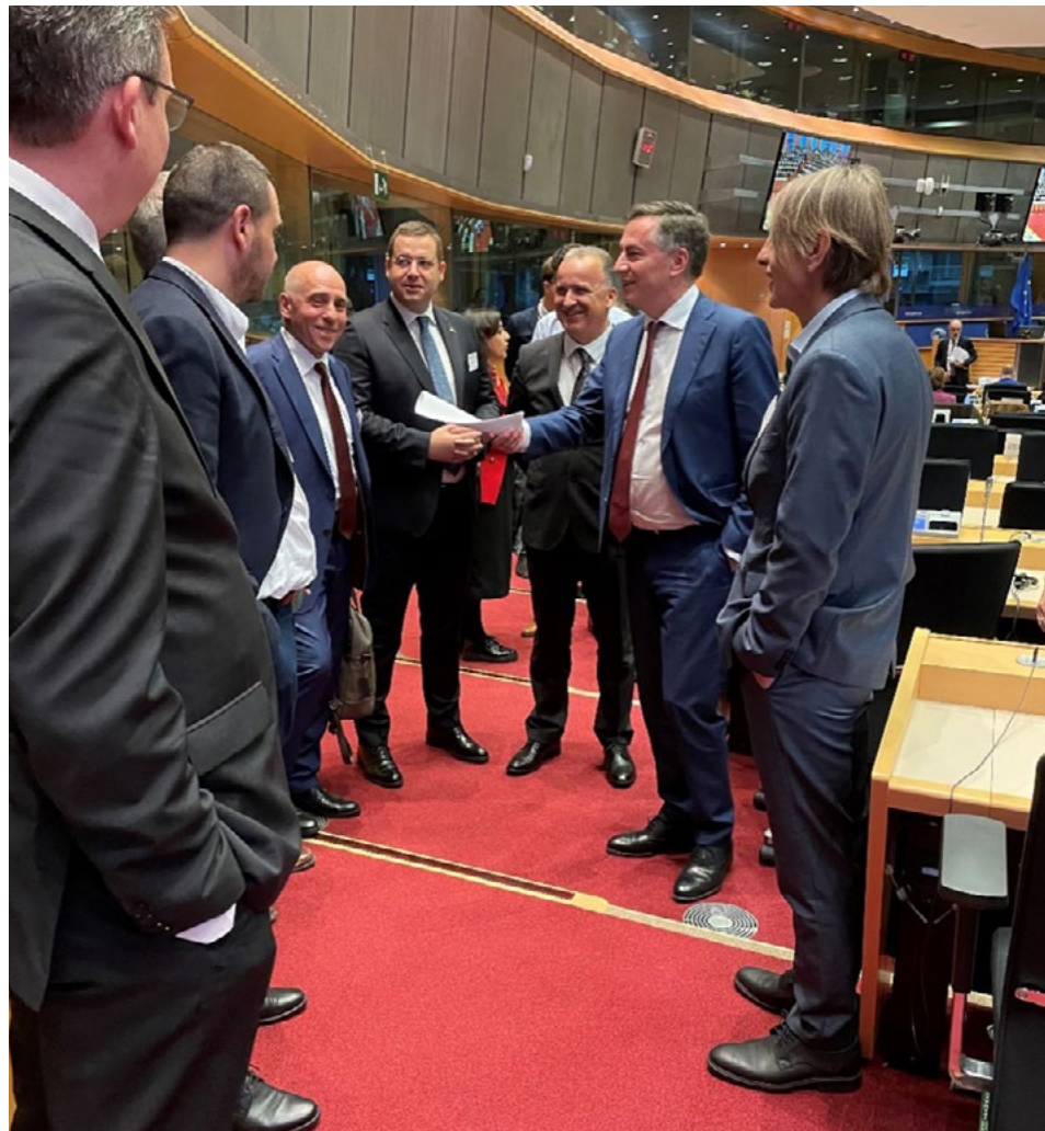
► STUDY VISIT FOR THE PARLIAMENT OF BOSNIA AND HERZEGOVINA

Additional programmes are dedicated to more specific topics, such as empowering women-parliamentarians and fighting misinformation.